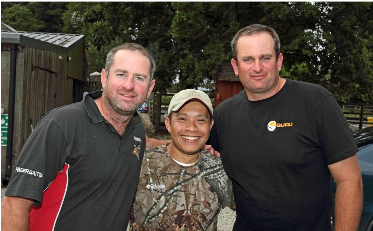
The Ringers, top feeder anglers and hot tub aficionados.